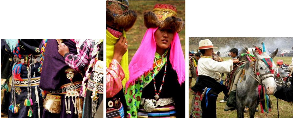
Passed by interesting local festival

Day 5 Lhasa-Yamdrok-Gyantse: Today we will continue our journey to other places of Tibet. About hundred kilometers, you will appreciate the holy Lake of Yamdrokto Lake. Drive to historical city Gyantse. On the way, we can see the Karola Glacier Visit Pelkhor monastery for its famous Kumbum Pagoda . ON Gyantse.