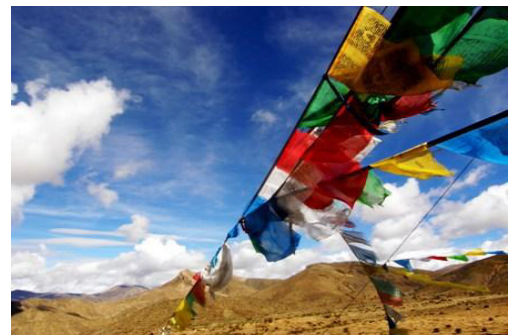
Night View on Potala Palace/ Tibetan boy/ Prayer Flag

Tibet Autonomous Region is located at the Southwest part of China, with a land area of 1.22 million sq km and a population of 2.3 millions, in which 95% are Tibetan nationality. There are also 30 other nationalities in Tibet, such as Han, Menba, Luoba, Hui, Monggul, Naxi as well as Cheng and Sharba peoples.