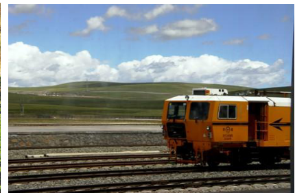
Stunning View along the journey/Qinghai Train